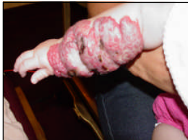
Hemangioma can occur any where on the body.

body however; most occur in the head and neck region.